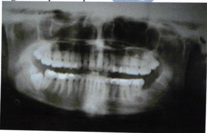
Fig.4 Postoperative OPG

recipient site, and the use of a nonrigid splinting technique.(6) Preoperative antibiotics are helpful.