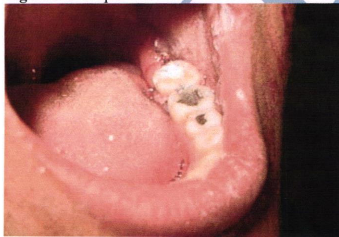
Fig.3 Postoperative picture