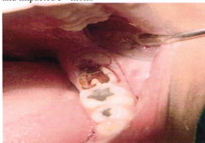
Fig.2 Intraoral picture