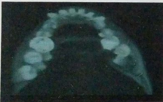
Figure 5. Occlusal view showing supernumerary teeth in right and left mandibular molar region

The incidence is considerably higher in the maxillary incisor region followed by maxillary third molar and mandibular molar, premolar, canine and lateral incisors.[5] Though there is no significant sex distribution in primary supernumerary teeth, males are affected approximately twice than females in the permanent dentition.[6,7]