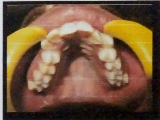
Figure 2(a) Intraoral view showing maxillary arch with slight crowding of teeth.

permanent teeth, and post permanent or complementary; Morphologically as conical, tuberculate, supplemental (eumorphic) and odontome; Topographically as mesiodens, paramolar, distomolar and parapremolar, and according to Orientation as vertical, inverted and transverse[8]. Paramolars are supernumerary molars, usually rudimentary (dysmorphic), situated buccally or lingually/palataly to the molar row. Mostly, they are situated between the second and third molars, while in very rare cases they can be found in between the first and second molars. Distomolars are situated either directly distal or distolingually to the third molar and are usually rudimentary conical shape.