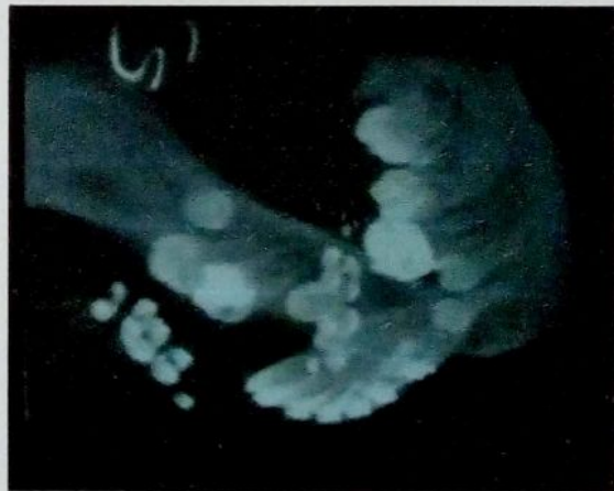
Figure 4(b) Denta scan showing supernumerary tooth in right mandibular molar region