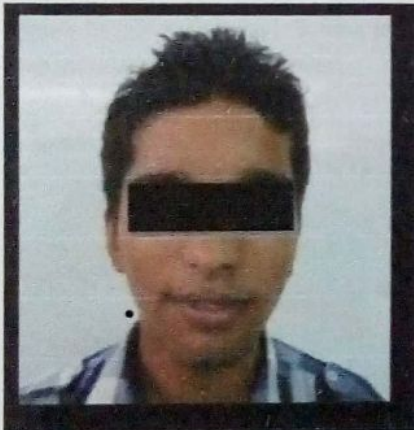
Figure 1: Profile view

Supernumerary teeth or hyperdontia are the existence of an excessive number of teeth in relation to the normal dental formula, and they may develop at any location in either upper or lower dental arch. While single tooth impaction is not uncommon, development of multiple impacted teeth is a rare condition and often found in association with syndromes or developmental anomalies such as cleidocranial dysplasia, Gardner's syndrome, trichorhino phalangeic syndrome, and cleft lip and palate. However, it can be present in patients without any systemic pathology. The presence of supernumerary teeth can cause alterations in neighbouring teeth, commonly retained teeth or delayed eruption, ectopic eruption, dental malposition, occlusal problems, diastema, and rotation.