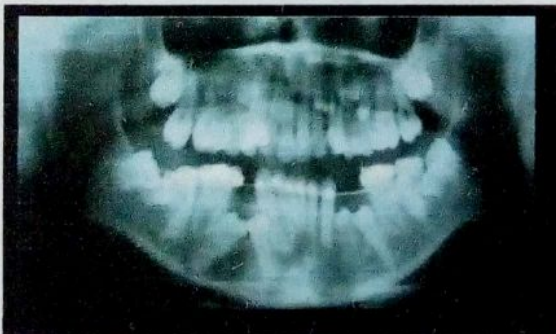
Figure 3. O.P.G showing multiple supernumerary teeth in maxillary premolar and mandibular molar region